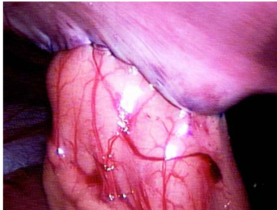
Laparoscopic view of completed gastropexy.

Gastropexy can now be performed using laparoscopic techniques. This minimally invasive procedure is performed by introducing surgical instruments through two or three small incisions. This greatly reduces bruising of the abdominal wall and postoperative pain. Shorter anesthetic time and faster recovery are further benefits of this procedure, when compared to gastropexy performed using the standard “open” techniques.