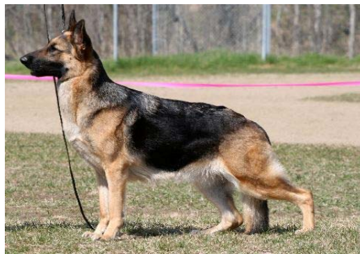
“Dilly”, German Shepherd, Photo courtesy of Meleah Fowler

Some breeds of dogs are at high risk for gastric dilatation and volvulus and should be considered for laparoscopic gastropexy. Examples include Great Danes, St. Bernards, Standard Poodles, Cocker Spaniels, German Shepherds, Malinois, and Gordon and Irish Setters. Similarly, dogs that have previously bloated and dogs that have had a parent or sibling that has bloated are good candidates for laparoscopic gastropexy. Laparoscopic gastropexy can be performed in conjunction with other laparoscopic procedures such as ovariectomy or cryptorchidectomy.